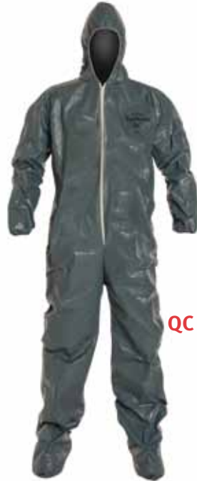
QC 122 S GY