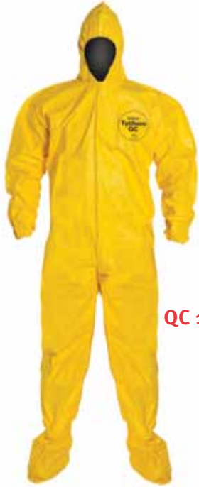
QC 122 S YL