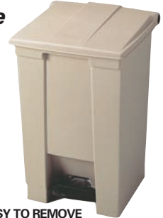
EASY TO REMOVE LEAK-PROOF RIGID LINERS