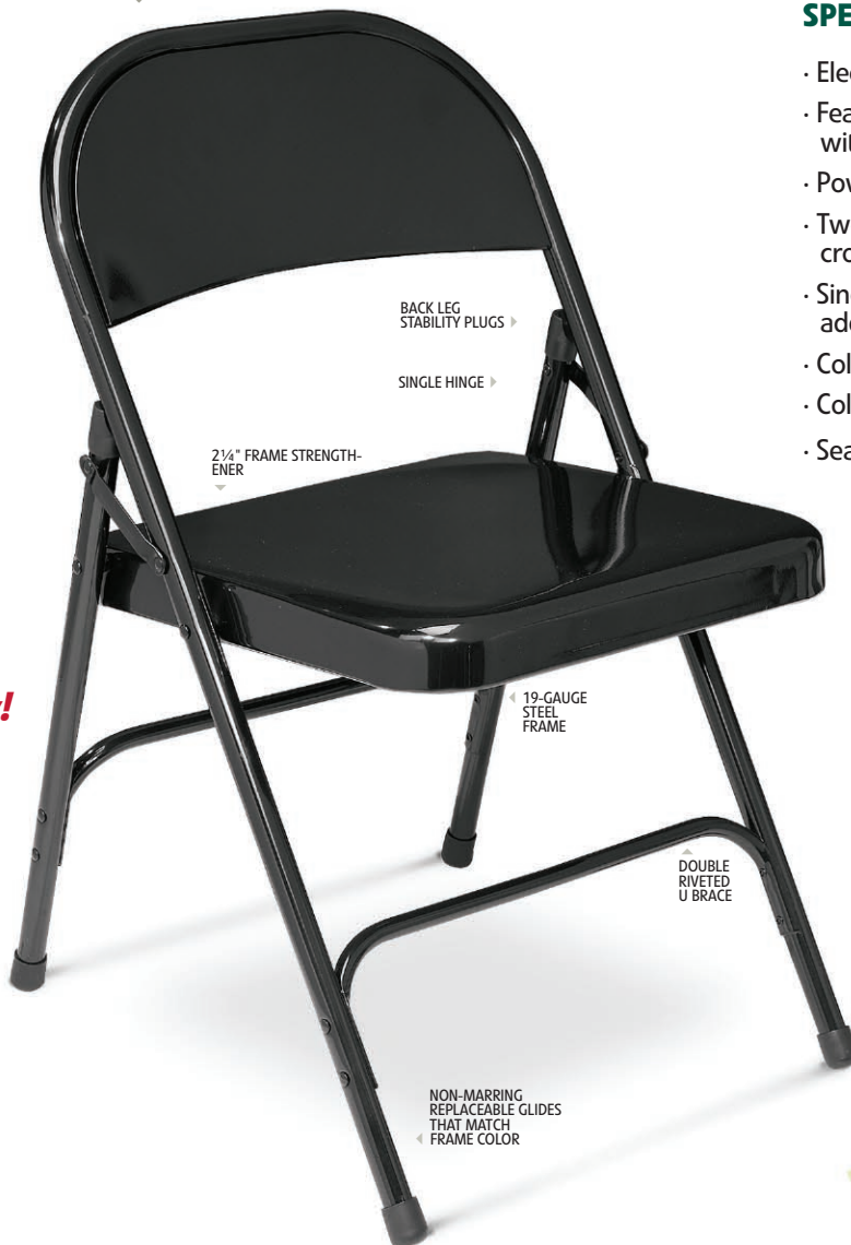
MODEL 510 SHOWN

products meet or exceed applicable ANSI/BIFMA standards