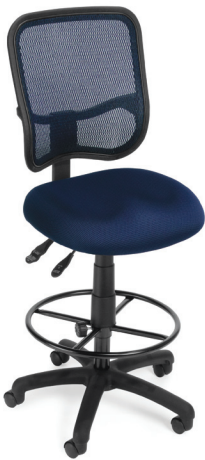
130-DK Modern Mesh Ergonomic Task Stool