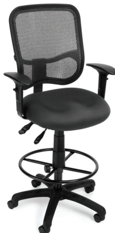
130-AA3-DK Modern Mesh Ergonomic Task Stool with Arms