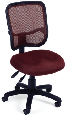
130 Modern Mesh Ergonomic Task Chair