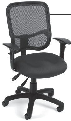
130-AA3 Modern Mesh Ergonomic Task Chair with Arms