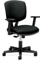
H5703 TASK CHAIR | SYNCHRO-TILT 1|2|4|5|6|7