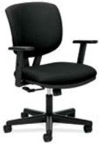
H5701 TASK CHAIR | CENTER-TILT 1|2|3|5|6|7