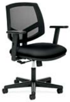
H5711 MESH BACK TASK CHAIR CENTER-TILT 1|2|3|5|6|7