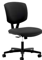
H5723 TASK CHAIR | SYNCHRO-TILT 1|2|4|5|6|7