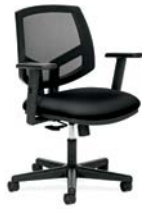
H5713 MESH BACK TASK CHAIR SYNCHRO-TILT 1|2|4|5|6|7