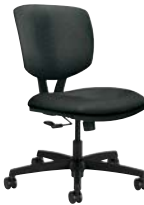
H5721 TASK CHAIR | CENTER-TILT 1|2|3|5|6|7