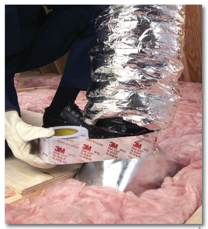
To seal fiberglass duct board and flexible duct systems, 3M^{\text{TM}} Foil Tape 3340 meets the performance requirements for UL 181A-P and UL 181B-FX.

Select from a variety of 3M^{\text{TM}} Metal Foil Tapes for any residential or commercial site application including rigid and flexible HVAC duct work.