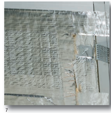
3M™ FSK Facing Tape 3320 is engineered specifically as a vapor retardant tape to seal mineral wool foil-faced insulation, bare sheet metal ducts, and blanket style fiberglass duct insulation.