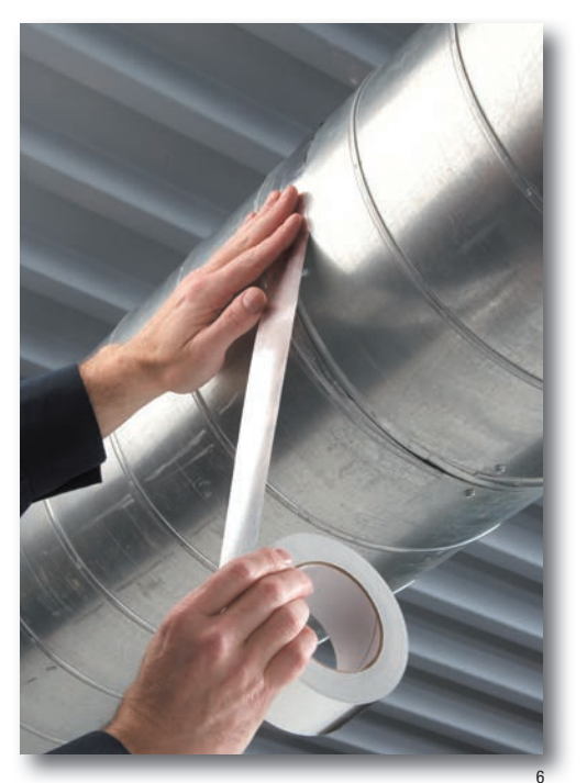
With aggressive adhesive and dead soft aluminum, 3M™ Foil Tape 3380 seals and secures seams and joints for long-term durability. UL 723 Listed for duct sealing and general repairs.