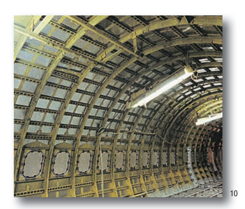
3M<sup>™</sup> Damping Foil 435 between the ribs and stringers of an aircraft fuselage helps reduce vibrational fatigue and noise inside the passenger cabin.