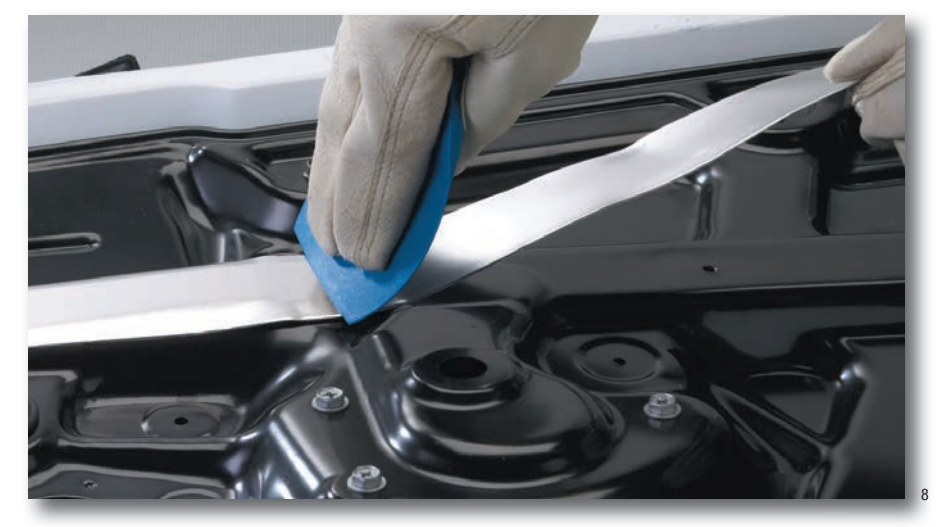
Applied with a 3M<sup>™</sup> PA-1 Wiper to the inside of a car door, 3M<sup>™</sup> Damping Foil 2552 effectively damps noise and vibration with as little as 10% surface coverage. Optimized acrylic on a dead soft aluminum constraining layer converts vibrational energy to negligible heat that readily dissipates.