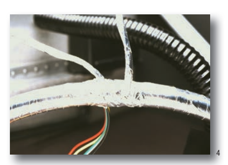
Tear-resistant 3M<sup>™</sup> Reinforced Aluminum Foil Tape 363 bundles wire harnesses and helps protect wires, cables, and other flexible parts from heat.