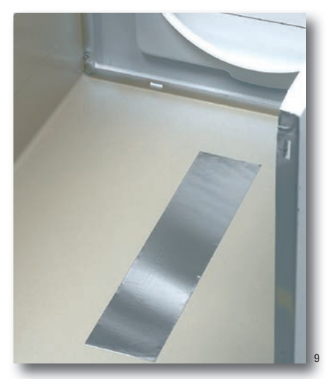
3M<sup>™</sup> Damping Foil 2552 on the inside of a washing machine reduces structure-borne noise and reduces vibrational fatigue to decrease the risk of part loosening and displacement.