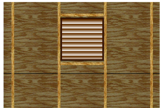
Figure 1 - Building the Mounting Box