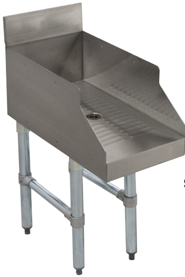
SL-GS Series 23" Wide Units