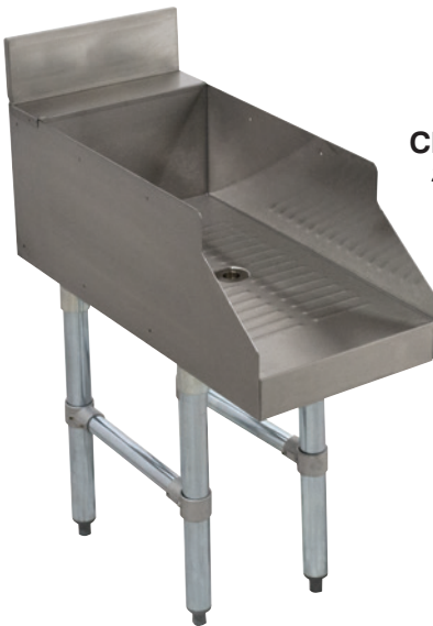
CR-GS Series 26" Wide Units