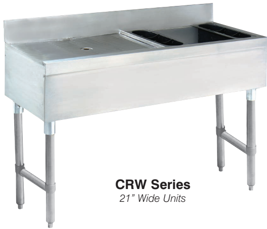
CRW Series 21" Wide Units