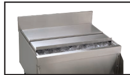
Optional Sliding Stainless Steel Cover Shown