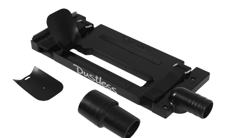
DustBuddie for 7-1/4" Worm Drive & Hypoid Circular Saws Model #D4000