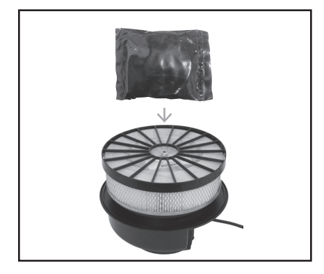
NOTE: DO NOT REMOVE FILTER CLEANING WEIGHT FROM BAG.

3. Place the weighted filter cleaning plate on HEPA filter support.