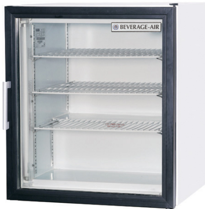
CF3 (unit shown without leveling legs installed)