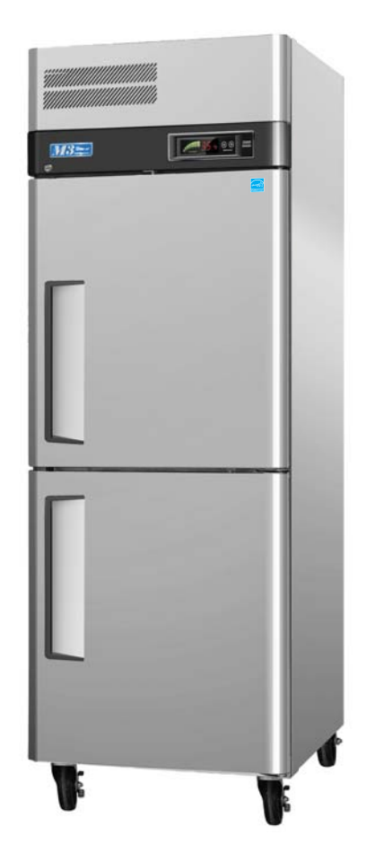
Freezer holds -10°F ~ 0°F for the best in frozen food preservation