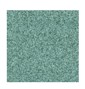
199 - Stone