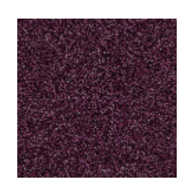
187 - Berry