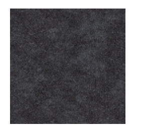
201 - Twilight