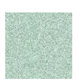
193 - Silver