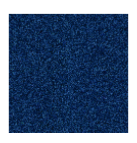
195 - Navy