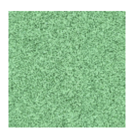
189 - Mint