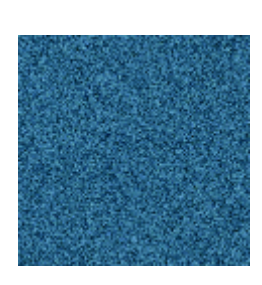
191 - Ocean