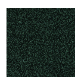
183 - Ebony