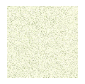
185 - Ivory