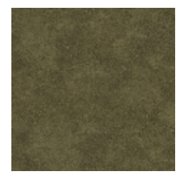
202 - Forest