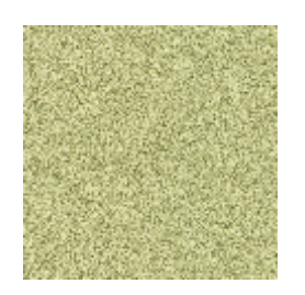
181 - Caramel