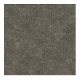
205 - Charcoal