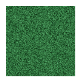
197 - Spruce