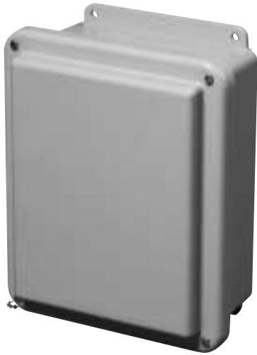
HW-J100805SC Crowned Cover Model Shown