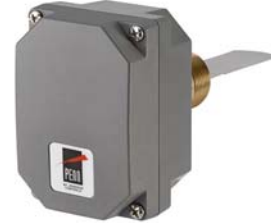
F261 Flow Switch