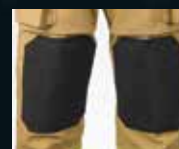
Knee Expansion Pleats