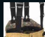
Black-Ops™ Multi-Adjust Suspender System