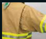
Pleated Back gives freedom of movement

Compliant to the new 2013 Edition NFPA 1971