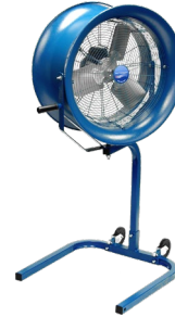
PS Portable Stroller