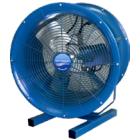
PB Pedestal Base