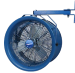
RM Rack Mount