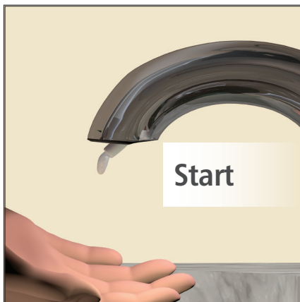
1. Place hand for dosing.

Rubbermaid's OneShot Foam pumps are newly-designed to pull excess foam soap back into the refill after dispensing. The result is reduced foam soap dripping into the sink. Our refills eliminate waste and the unsightly mess that the drips leave behind.