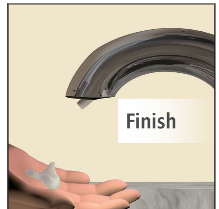
3. Soap is pulled back into the dispensing tube, reducing drips.