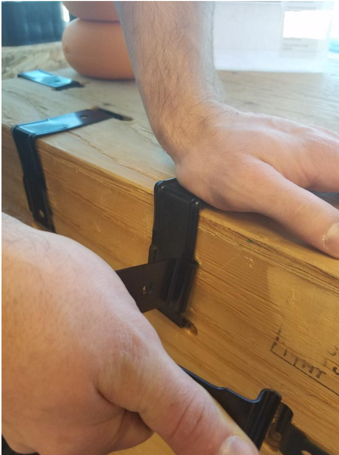
CLIP WITH CLIP