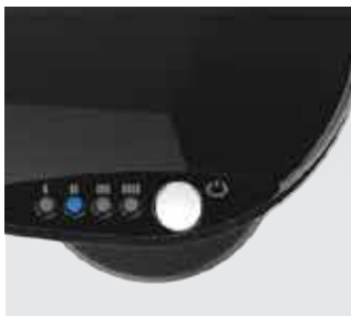
4 SPEED PUSH BUTTON CONTROL