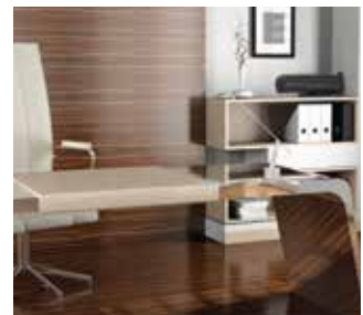
STYLE & FUNCTION