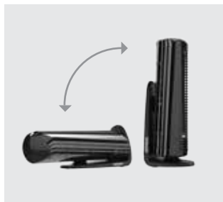
HORIZONTAL AND VERTICAL COOLING