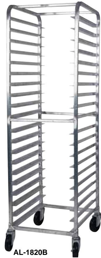
AL-1820B End Loading