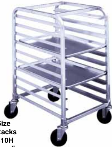
1/2" Size Pan Racks AL-1810H End Loading