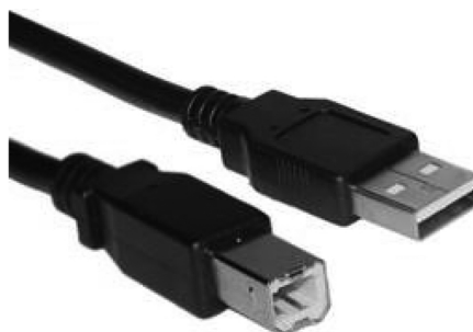
Figure 2.1 USB A to USB B cable

Note: The USB cable is not included with the scale. A USB A to USB B cable is required. Refer to the following photo.