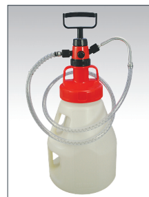
Pictured with: 10 Liter / US Quart Drum & Red Utility Lid