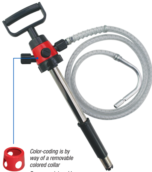
Color-coding is by way of a removable colored collar Pump as pictured here: Part# 102308 – Red

Feature rich and will handle up to ISO 680 fluids