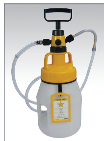
Pictured with: Yellow Utility Lid & Yellow Drum Label Kit