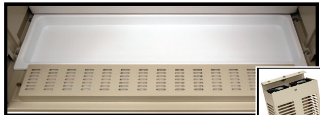
HEPA® filter and removable drip tray