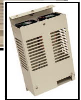
Drying fan has multiple international input options

Color Shown is Sand Custom Colors Available