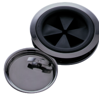
#7 Collar Adaptor with Splash Baffle and Stopper