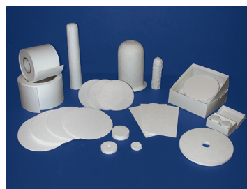
Filters – glass microfiber, cellulose, and membranes

Also available is a full line of high-quality, competitively priced sample preparation products for your QA/QC Laboratory.