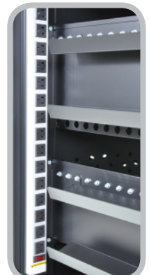
Rear access door of the LLTM30-B open to the power strips.