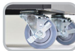
Coated dividers and non skid casters