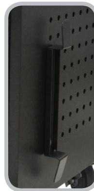
Side cord wrap for convenience.