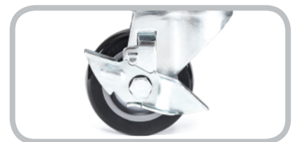
3" Swivel Caster