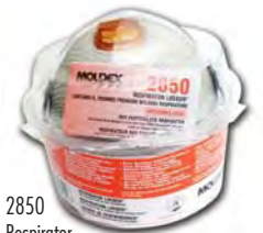
2850 Respirator Locker