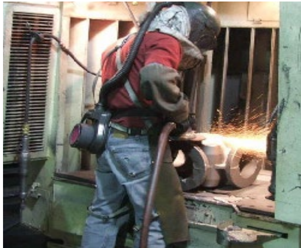
A worker grinding castings in a foundry. The work is performed in a ventilated booth to reduce the worker's exposure to silica.