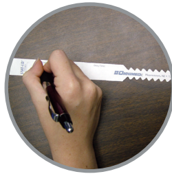
Surface accepts writing, typing or embossing

Stat ID Interim Identification Bracelet #291301