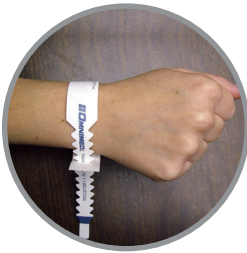
Easy to apply