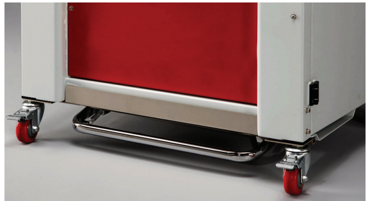
FOOT BAR ACTIVATION