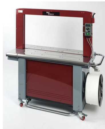
SM65 12MM MACHINE WITH ROLLER TABLES