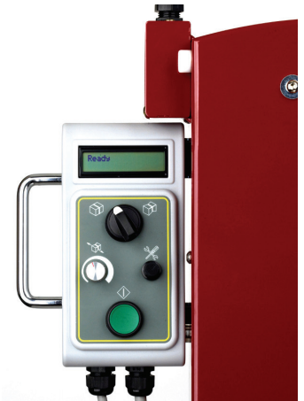
PIVOTING CONTROL PANEL