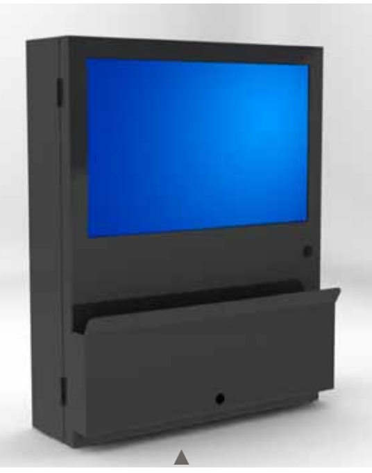
Shown with optional folding keyboard tray. Fixed keyboard tray is standard.

Each unit has a built-in fan and filter system for positive or negative airflow to protect your computer equipment from water, dust, oil, etc.