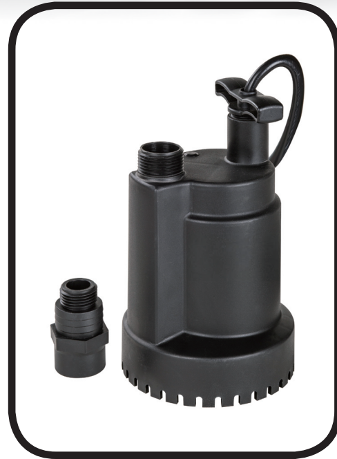
Submersible Utility Pump 1" NPT Discharge, 1/8" Spherical Solids Manual Operation