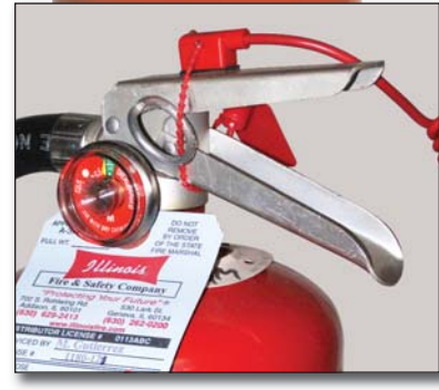
Beaded Strap wraps around entire handle passing through the Pin and Sensor to ensure that the alarm will sound if tampered.

Ask Your Regional Sales Manager or Se-Kure Customer Service Representative for additional information.