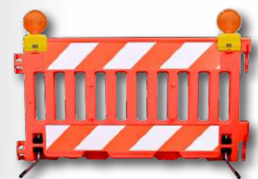
Locations for Two Barricade Lights and Recessed Areas for Reflective Sheeting

WEIGHT: 23 pounds HEIGHT: 38 inches LENGTH: 72 inches WIDTH: 3 inches MATERIAL: UV stabilized polyethylene