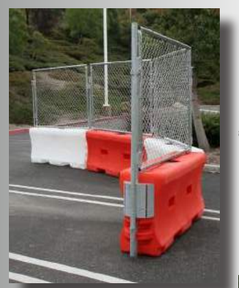
Water-Wall Fence Rotates up to 30°

The chain link fence will attach to the top of a longitudinal barrier, (TrafFix Water-Wall™), creating additional security to a work zone. The mesh fence will be made of 11 gauge steel, connected to vertical steel posts of 1 5/8" diameter. Fence sections will be 6' wide x 4' tall. Each fence section shall weigh no more than 42 lbs including the connector T-pin. Each T-pin will extend down through the sections of fence into the knuckles of the TrafFix Water-Wall to securely connect the fence to the wall. Each T-pin shall have a hole at the upper end for a security bolt to enhance security. The fence will accommodate a 6' single gate or a 12' double gate for entrance or exit from the work zone. For maximum stability, the TrafFix Water-Wall, filled with water will weigh 1,110 pounds. Overall height of the Water-Wall Fence attached to the top of the TrafFix Water-Wall will be a minimum 84".