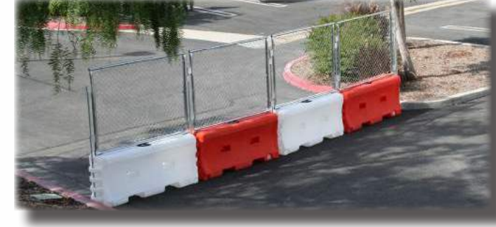
Ideal for vertical construction. Secure and easy to deploy.