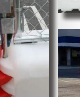
Pin Connects Wall to Wall and Fence to Fence