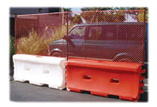
Water-Wall with extended connection pins and plastic fence.