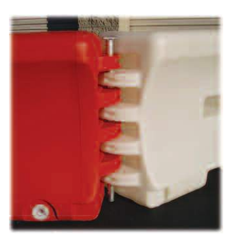
Water-Wall can pivot 30-degrees and be locked together with steel connection pins.