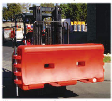
Water-Wall can be easily lifted and placed using a forklift or pallet jack.

© Copyright January, 2007 TrafFix Devices, Inc. TrafFix® and Water-Wall™ are trademarks of TrafFix Devices, Inc. U.S. patents pending.