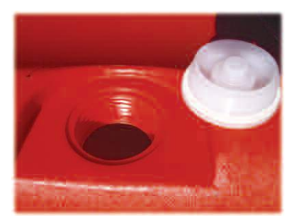
New tamper resistant, corner offset drain plug with coarse buttress thread — screws in or out in only 2 1/2 turns.