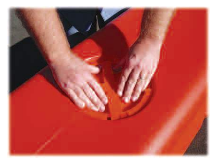
Large 8" fill hole speeds filling process, includes twist-lock plastic cap.