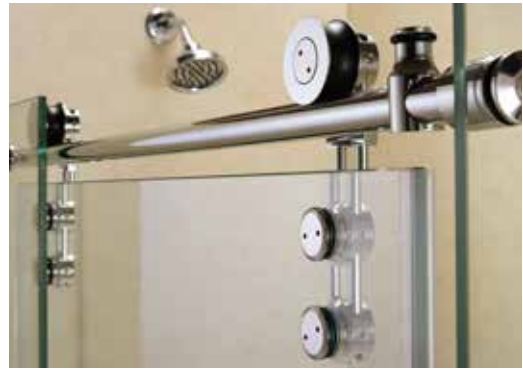
WHEEL ASSEMBLY & TOP BAR TRACK