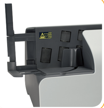
Easy-to-use support arm extends to hold large envelopes