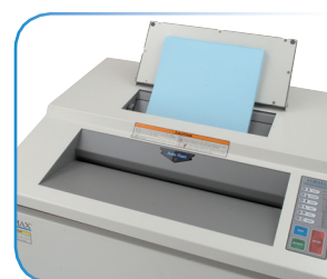
AutoFeeder holds up to 175 sheets. Load, press start and walk away!