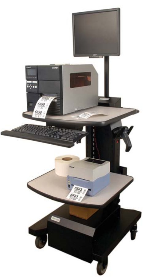
NB Series Workstation shown above with optional second shelf, post-mounted flat screen holder and keyboard tray.