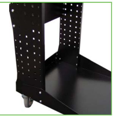
Full storage on lower shelf w/non powered version