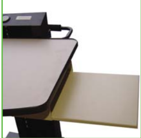
Slide-out shelf for NB & RC Series