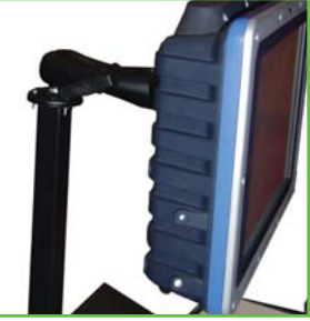
LCD support for NB & PC Series