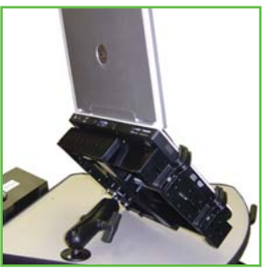
Laptop/tablet holder for NB, PC & RC Series