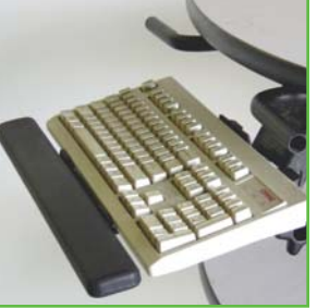
Adjustable keyboard tray for NB & RC Series