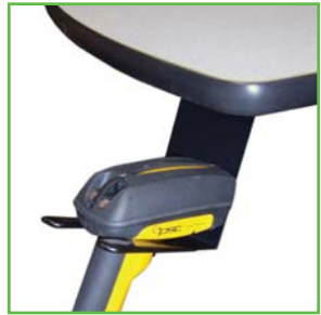
Scanner holder for NB, PC & RC Series

\hfill \ensuremath{\mathbb{O}} Newcastle Systems, Inc. / USA \hfill \ensuremath{\mathsf{Rev.}} 18 Content is subject to change without notification