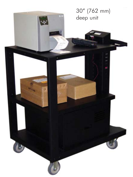
PC Series Workstation with optional middle shelf

A number of optional accessories are available and can be easily integrated in seconds for a highly verstile workstation. (See accessories on page 8).