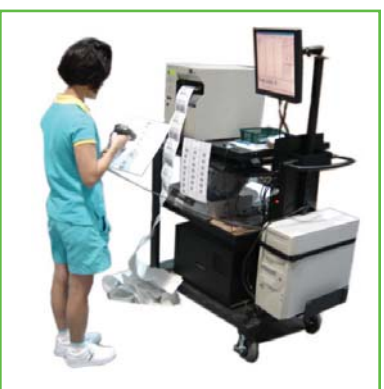
Mobile print station