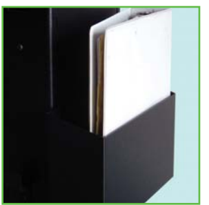
Binder holder for NB & PC Series