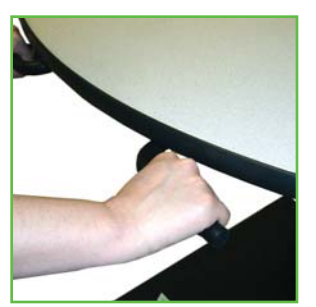
Add-on push handles for NB Series