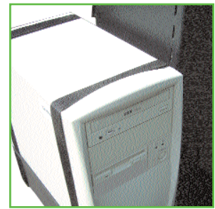
CPU holder for NB & PC Series