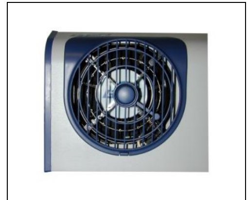
Removable fan plate with safety switch and point cleaner.

BFN series AC ionizers from Transforming Technologies create a dense and well-balanced ionization current. They are unique in their ability to deliver fast decay times with low offset voltages. Continuous balance and decay protection is assured by the reliable AC design. An integrated emitter point cleaner, removable front and rear fan guards, safety switch combine to make the BFN 803 a user friendly ionizer.