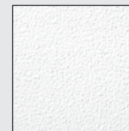
WHITE CRF – CRF-1