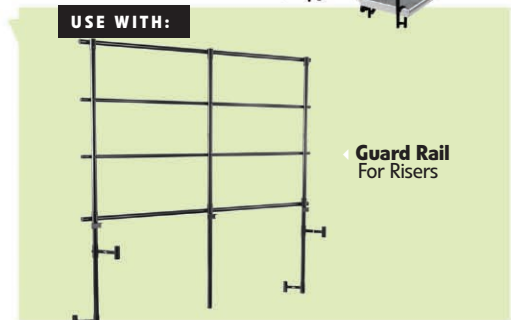
Guard Rail For Risers

NOW AVAILABLE: 4 th Level Add-On FOR THE Trans-Port Riser MODEL #TPA