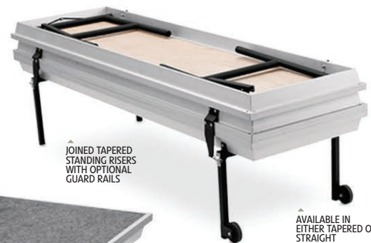
JOINED TAPERED STANDING RISERS WITH OPTIONAL GUARD RAILS

Straight and Tapered units cannot be combined. Straight units can only be ganged with straight units; Tapered units can only be ganged with tapered units.