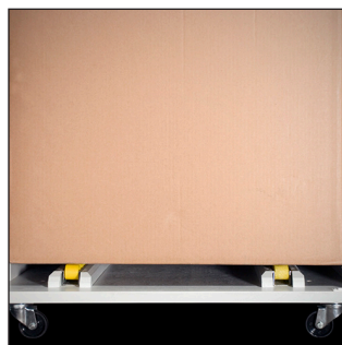
Conveyor of rollers on each side allows for easy removal of the 50 gallon waste container.