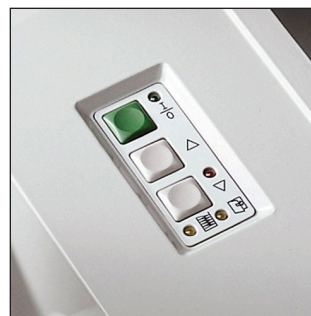
The electronic control panel allows for auto on/off, continuous run, and reverse operation.