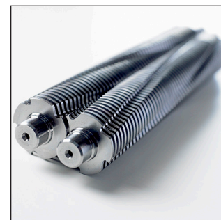
In order to provide slip free power to the cutting cylinders, a steel chain & gears connect the two for maximum capacity.