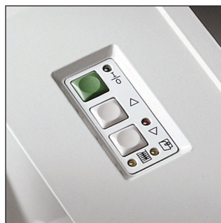
The electronic control panel allows for auto on/off, continuous run, and reverse operation.