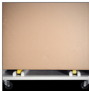
Conveyor of rollers on each side allows for easy removal of the 50 gallon waste container.