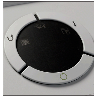
The easy-to-use command dial controls all of the shredder's functions such as power up, reverse, and continuous run.