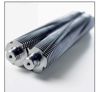
In order to provide slip free power to the cutting cylinders, a steel chain & gears connect the two for maximum capacity.