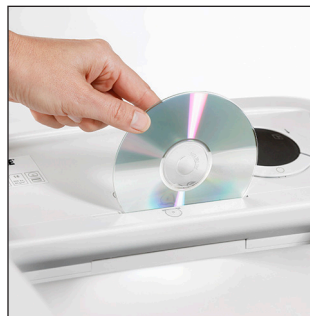
Dahle Professional shredder with built in user-friendly opening for CD/DVD destruction.