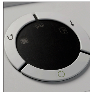
The easy-to-use command dial controls all of the shredder's functions such as power up, reverse, and continuous run.