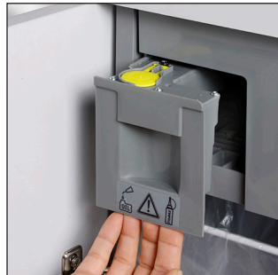
Built in EvenFlow Lubrication System evenly lubricates the cutting cylinders reducing the risk of a paper jam.